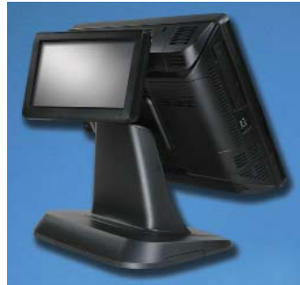
Optional Integrated 7" Rear LCD Customer Display