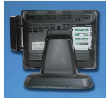
Tool-Free Access to Hard Disk Drive and RAM Optimizes Serviceability