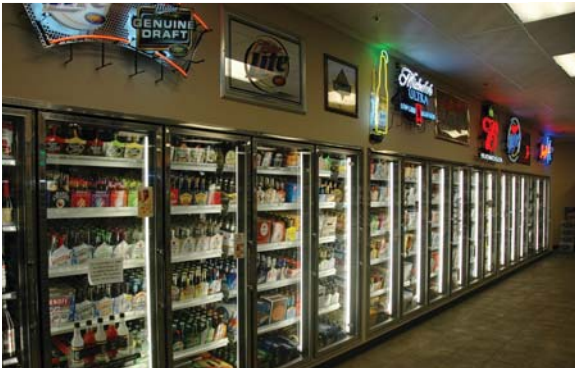
Retail Stores / Liquor Stores