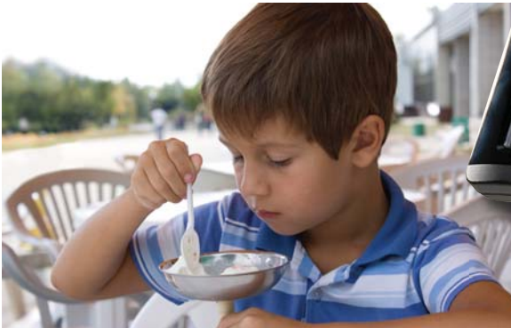
Quick Service Restaurants / Ice Cream Parlors