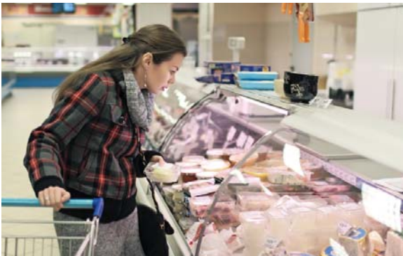
Grocery Stores / Convenience Stores