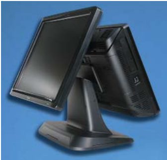
Optional Integrated 15" Rear LCD Customer Display