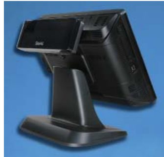
Optional Integrated VFD Customer Display