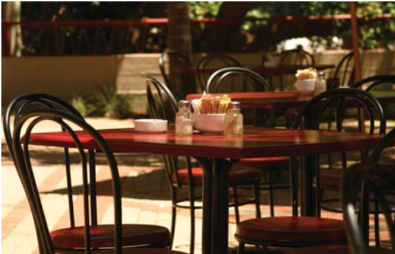
Table Service Restaurants