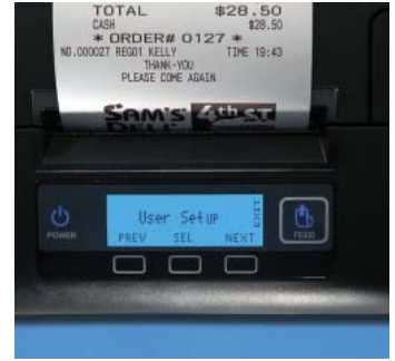
Liquid Crystal Display Guides the Operator Through Setup and Option Selections