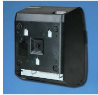
Built-In Wall Mount Capability