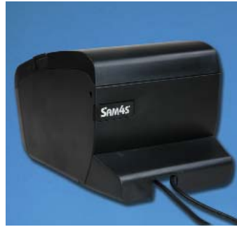
Standard Cable Management Cover