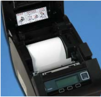
Drop and Print Paper Loading – Optional Paper Width Selector Allows 58mm Wide Paper Rolls